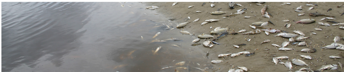
Image: Dead fish at Ballina after flooding in 2008.