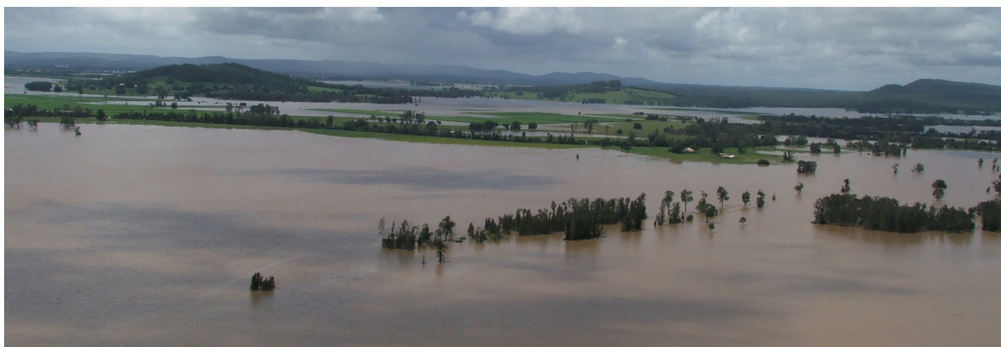
Image: Deep inundation of the floodplain during 2008 major flood.